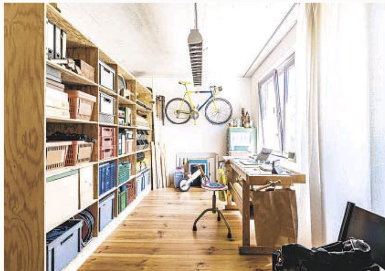
Storage and natural light are key to a good, functional hobby space.

"If you don't have access to a view of the outdoors, you can hang up images that you find relaxing and inspiring. And if you lack a door for privacy, listening to music with headphones can help keep out noise distractions," Marshall said.